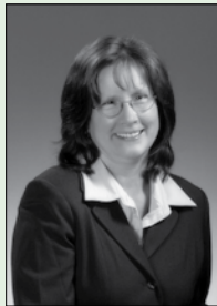
Personal Lines Protection Specialist